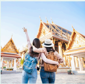
Access to thousands of resorts worldwide

Your membership may have expired – but the world is still waiting. Imagine island escapes in Palawan , unforgettable family moments in Orlando , winter magic in Lapland, Finland , or discovering the cultural beauty of Yunnan, China . Right now, without an active membership, you're missing out on: