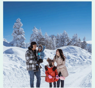
The ability to turn your vacation ownership into global travel experiences

For a limited time, you can return to a world of travel for just: