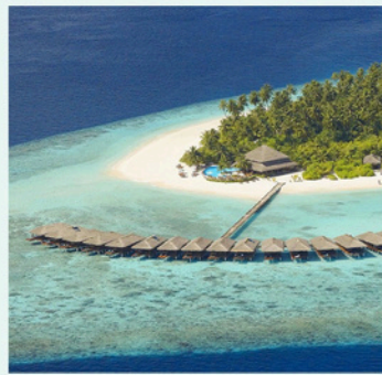
Exclusive member-only exchange opportunities