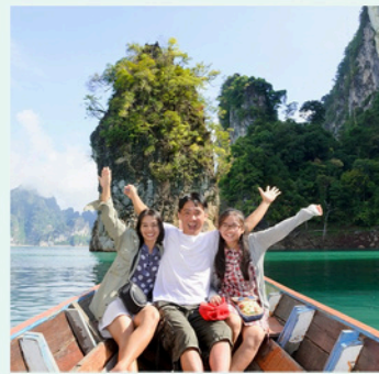
Flexible holiday planning across domestic and international destinations